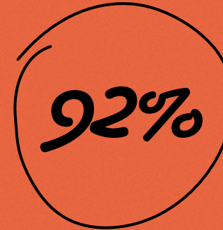
Continuation rate from 1st year of study*