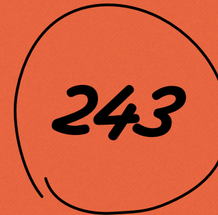
Current students supported