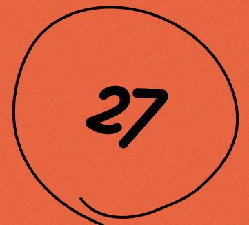
University partners in 18 cities