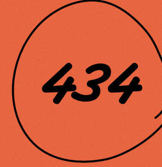
Scholarships awarded in total