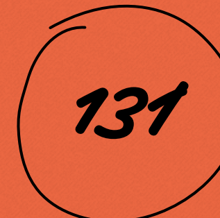
Graduates so far